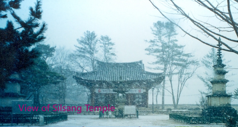
View of Silsang Temple