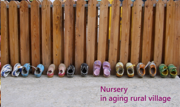
Nursery in aging rural village