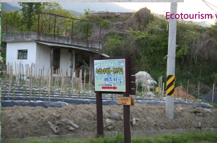
Ecotourism with Locals