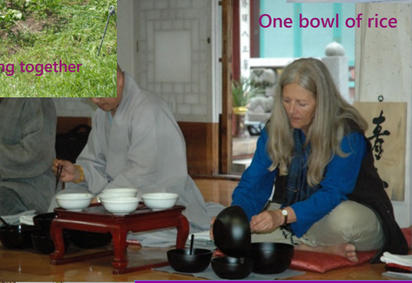
One bowl of rice